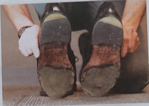
Wear out soles of shoes

Friction generates heat. Sometimes, this can be harmful. The heat produced in a fast moving machine is very high. Proper arrangements have to be made to cool the machine, otherwise, it can get damaged. If the cooling arrangement in a car does not work properly, the engine can get jammed.